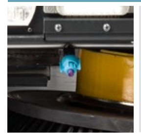
The side brushes of the MACH 8 can be equipped with a water nebulizing system to keep down dust when sweeping.