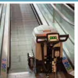
Once positioned, the machine works completely autonomously, and the user can therefore carry out other tasks in the vicinity, whilst supervising operation.